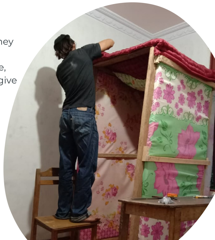
Preparing a sound booth for "JESUS" film recording