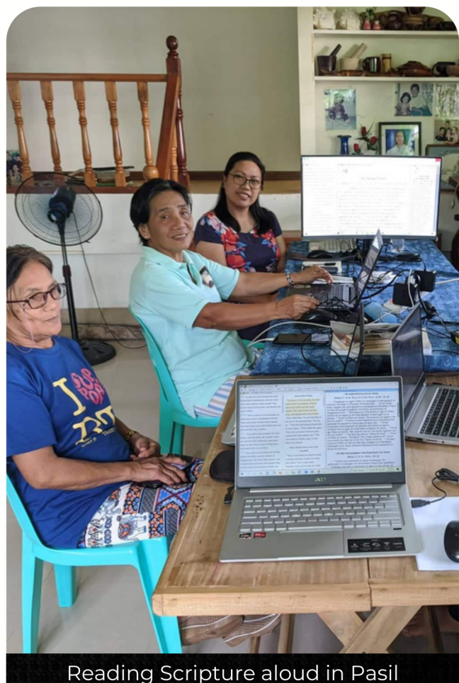
Reading Scripture aloud in Pasil