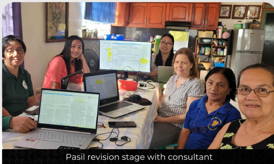
Pasil revision stage with consultant

That God will help the Pasil Guina-ang Kalinga team complete preparations to submit the New Testament for typesetting in June.