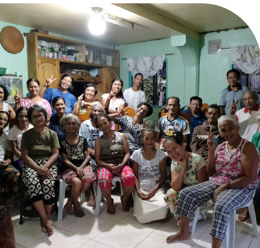
Pasil visit to senior citizens for community checking