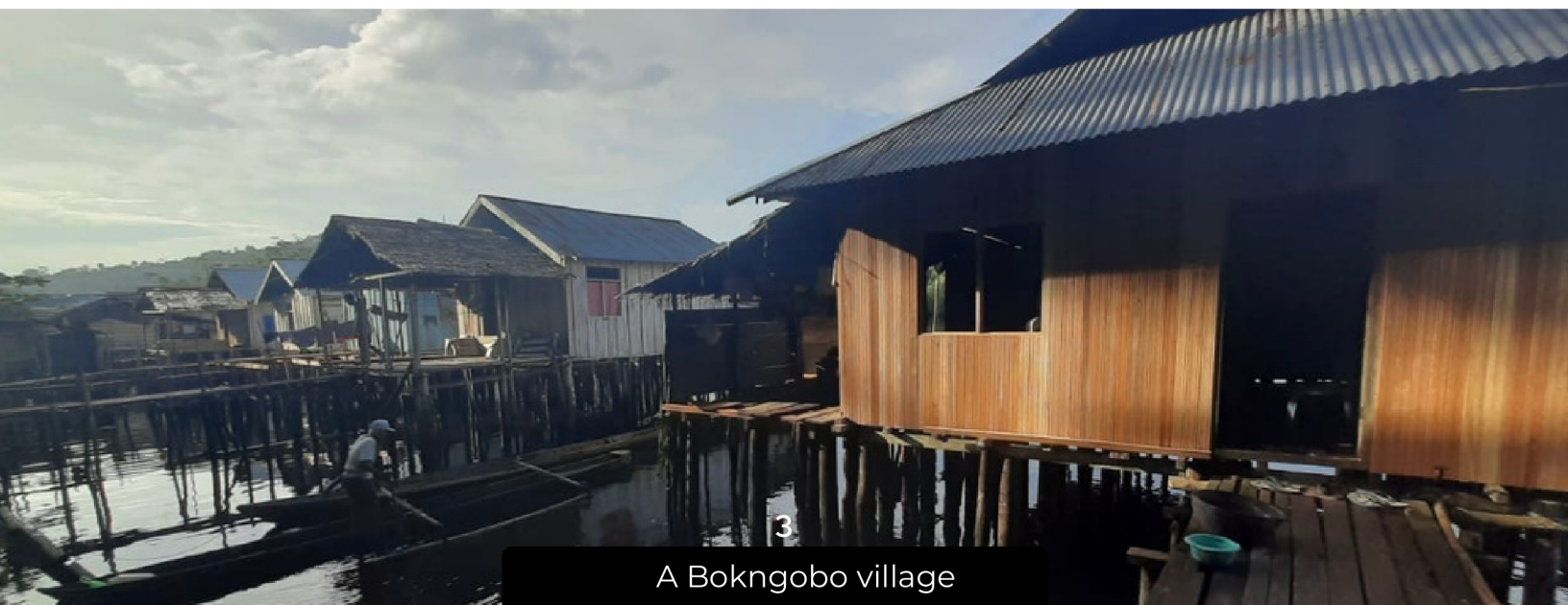
A Bokngobo village

By the end of this project, the Bokngobo people will have the Gospel of Luke, the "JESUS" film, and Scripture-based worship songs.