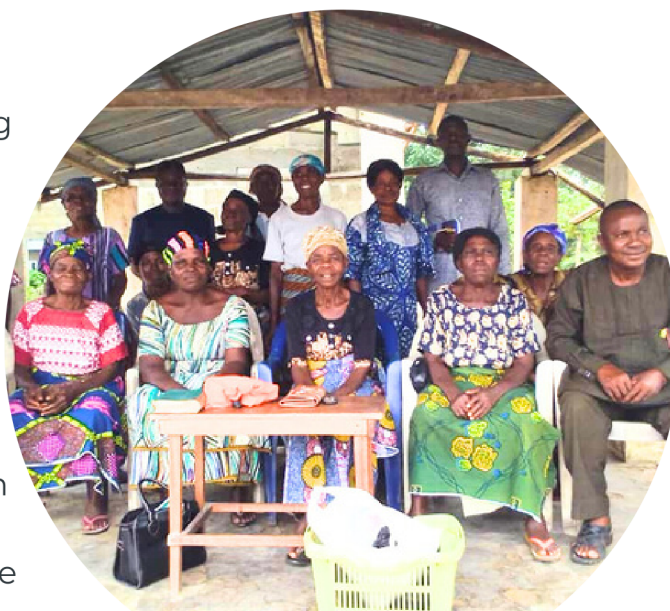
Ekpeye Women's Outreach

For the truth of God's Word to continue changing hearts among the Ekpeye and other groups with Oral Bible Storytelling teams in Nigeria, and for the strength of the teams as they work despite economic and security difficulties.